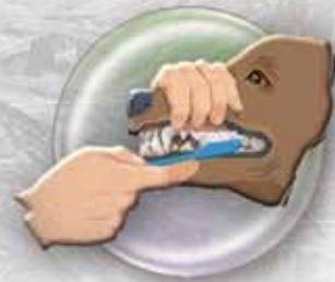
Cover three to four teeth at a time and use ten short back-and-forth motions.

Before even asking your unsuspecting pet to open wide, you'll need the right stuff on hand: a special pet toothbrush and special pet toothpaste. Don't use human toothpaste; they'll swallow it and get an upset stomach. They'll like their own paste, however; it comes in flavors like chicken and tuna. As with any training, the trick is to start early, proceed slowly and keep sessions short and positive.