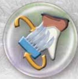
Place bristles at gum line, and at a 45-degree angle, brush in an oval pattern.