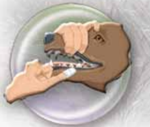
Gradually introduce toothpaste on your finger and gently rub in a circular motion.

The best preventive step for pets is the same as it is for people: brush regularly. In their case, of course, they need some help.