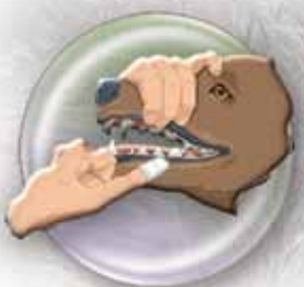
Gradually introduce toothpaste on your finger and gently rub in a circular motion.

Working up to brushing daily is ideal. But if her mouth is healthy, even three days a week can make a difference. Without brushing, plaque can build up, putting your pet at risk for bad breath, gum disease, and tooth decay. It can also cause painful infection. Severe infection can spread, causing life-threatening conditions.