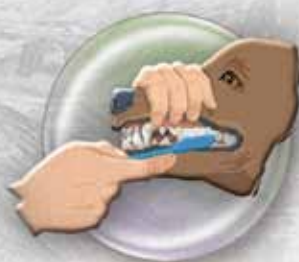
Cover three to four teeth at a time and use ten short back-and-forth motions.

The best preventive step for pets is the same as it is for people: brush regularly. In their case, of course, they need some help.