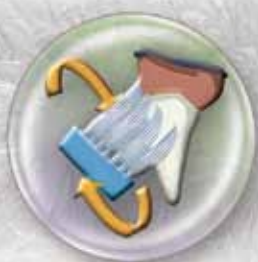
Place bristles at gum line, and at a 45-degree angle. Brush in an oval pattern.