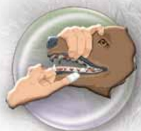
Gradually introduce toothpaste on your finger and gently rub in a circular motion.

Working up to brushing daily is ideal. But if her mouth is healthy, even three days a week can make a difference. Without brushing, plaque can build up, putting your pet at risk for bad breath, gum disease, and tooth decay. It can also cause painful infection. Severe infection can spread, causing life-threatening conditions.