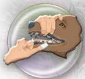
Gradually introduce toothpaste on your finger and gently rub in a circular motion.

Working up to brushing daily is ideal. But if her mouth is healthy, even three days a week can make a difference. Without brushing, plaque can build up, putting your pet at risk for bad breath, gum disease, and tooth decay. It can also cause painful infection. Severe infection can spread, causing life-threatening conditions.