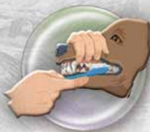
Cover three to four teeth at a time and use ten short back-and-forth motions.

The best preventive step for pets is the same as it is for people: brush regularly. In their case, of course, they need some help.